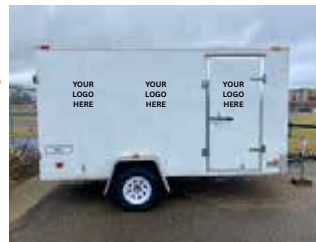
3 Sponsorships Available

Back Placement $67/mo. [$800/year] 3 year min.