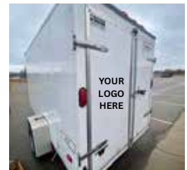
1 Sponsorship Available

The Club vans provide after-school transportation to get children safely to the Clubhouse from selected schools.