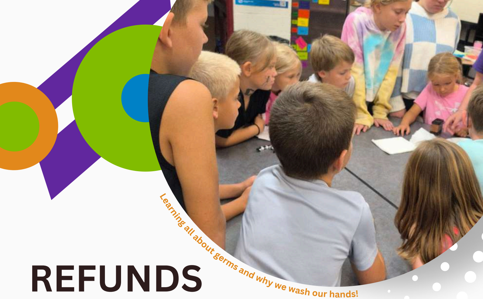
Learning all about germs and why we wash our hands!