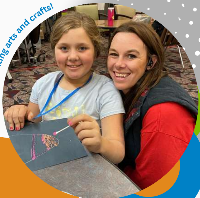
Creating arts and crafts!

If a family would like to end summer membership early they will need to complete the proper documentation. The Club requires a two week notice. Request more information from Branch Director.