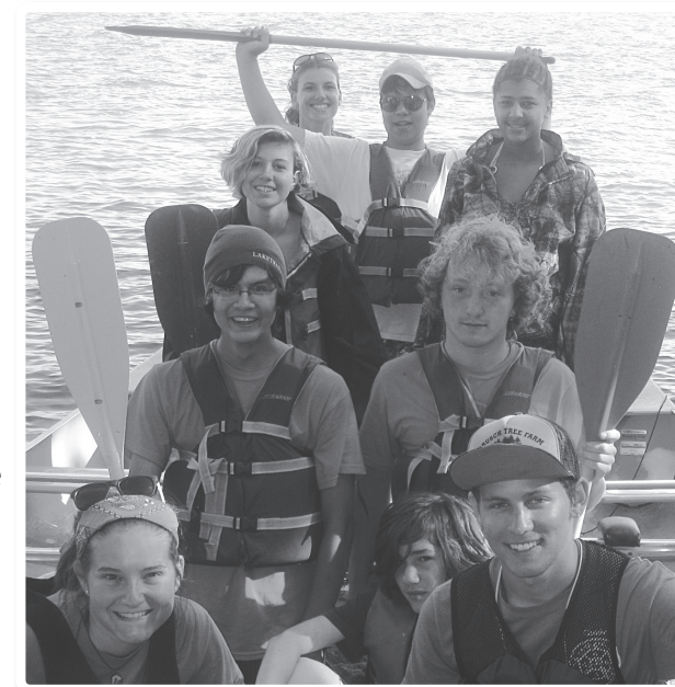
Photo from past outing.

Laketrails offers a combination of adventure and physical challenges while building bonds with peers and caring adults. Participants gain insights about their own strengths while learning to work with others to achieve a common goal. For many Club members, the Laketrails experience is their first wilderness adventure.