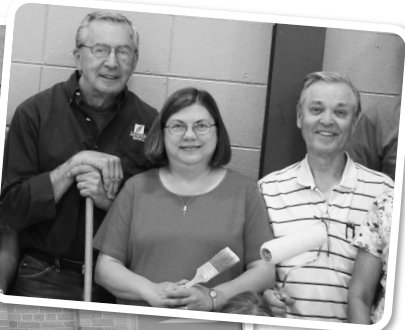
⤴ Modern Woodmen