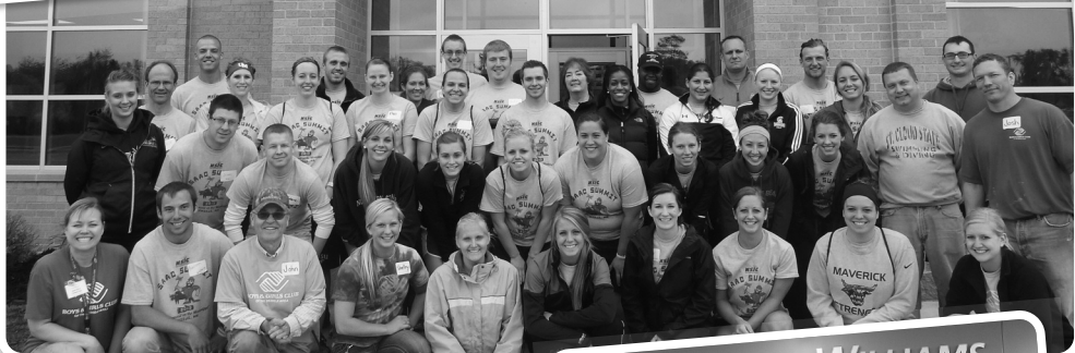
⤴ Bemidji State University