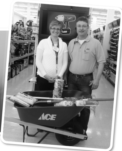
⤴ Ace on the Lake

Athletes, Club staff, family and friends stepped in to help. Together they painted the gym, hallways, restrooms and front desk area; washed windows; filled garden beds with mulch; swept sidewalks; cleaned the art room; cleaned computer equipment; and built raised beds and trellises for the garden high tunnel. Every day, Club members and staff are grateful for the community support that helps the Club inspire and enable youth to reach their full potential as productive, responsible and caring citizens. That’s community collaboration at its best.